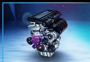
1.5L 4-Cylinder D-CVVT Engine