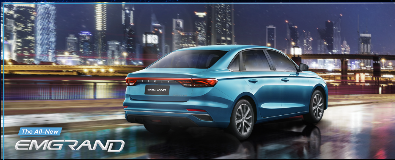
The All-New EMGRAND