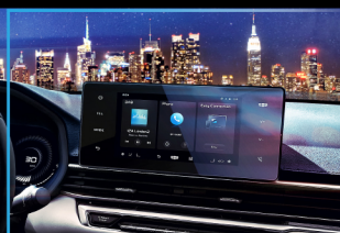
8-Inch Infotainment Screen