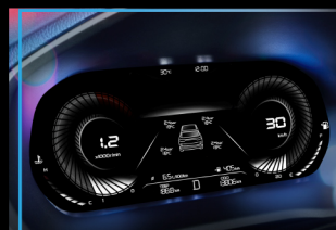
Full Digital Instrument Panel