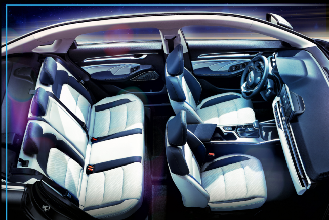
Comfortable Premium Interior